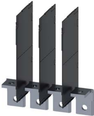
nut keeper kit right-angled; 4 units accessory for: 3VA13/14 3VA23/24