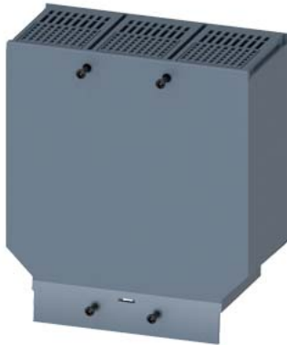
terminal cover broadened 3-pole; 1 unit accessory for: 3VA12