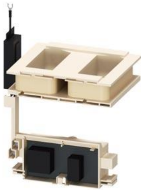
Magnet coil with switch-on electronics for contactor 3TF6844-C..., 110...132 V AC 50/60 Hz