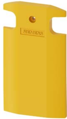
Cover yellow for position switch metal XL, 56 mm wide