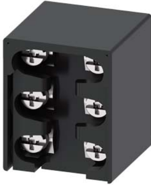
Contact block for position switch 3SE51/52 2 NO/1 NC slow-action contact