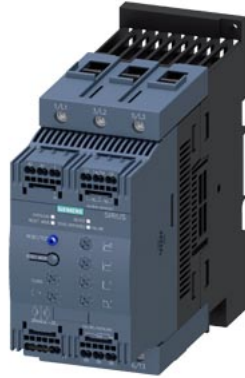
SIRIUS soft starter S3 106 A, 75 kW/500 V, 40 °C 400-600 V AC, 24 V AC/DC spring-type terminals