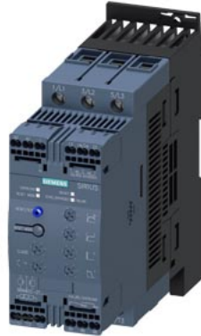
SIRIUS soft starter S2 63 A, 37 kW/500 V, 40 °C 400-600 V AC, 24 V AC/DC spring-type terminals Thermistor motor protection