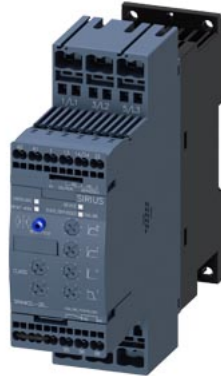
SIRIUS soft starter S0 25 A, 15 kW/500 V, 40 °C 400-600 V AC, 110-230 V AC/DC spring-type terminals