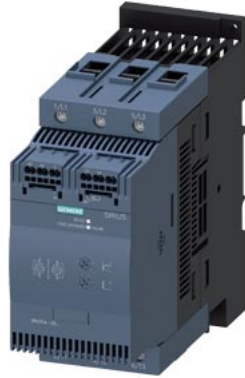
SIRIUS soft starter S3 106 A, 55 kW/400 V, 40 °C 200-480 V AC, 110-230 V AC/DC spring-type terminals