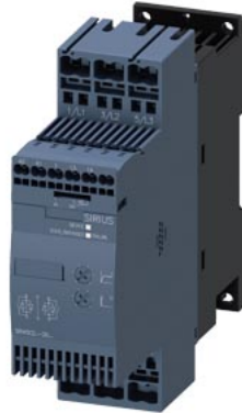
SIRIUS soft starter S0 25 A, 11 kW/400 V, 40 °C 200-480 V AC, 110-230 V AC/DC spring-type terminals