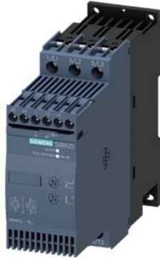
SIRIUS soft starter S0 25 A, 11 kW/400 V, 40 °C 200-480 V AC, 110-230 V AC/DC Screw terminals