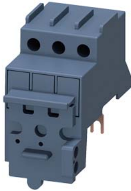
Disconnecter module for circuit breaker Size S00/S0