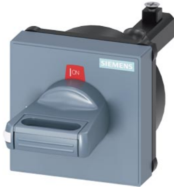
Door-coupling rotary operating mechanism for circuit breaker size S00...S3, black only handle (without trip) and coupling driver