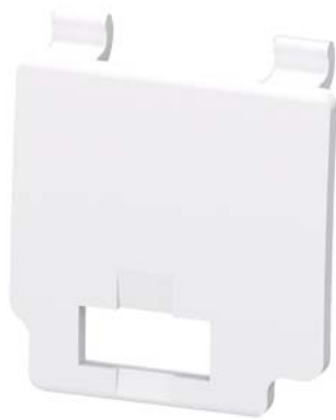
Scale cover, sealable for circuit breaker Size S00...S3