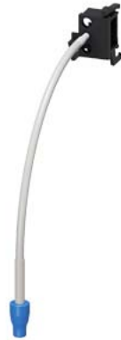
Cable release for reset 0.4 m for 3RU2 Size S00...S3