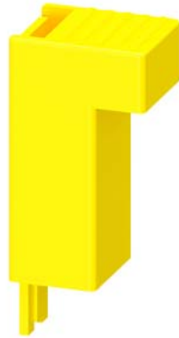
control kit for contactors 3RT2.3, 3RT2.4