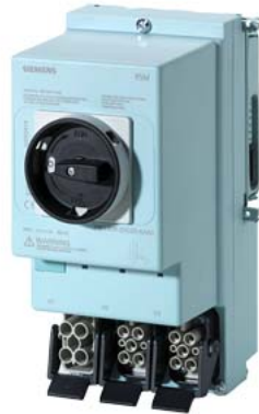
ET 200 RSM Maintenance switch module Up to 25 A Up to 25 A Disconnecter function for Main circuit Han Q4/2