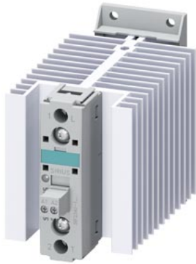
Solid-state contactor 1-phase 3RF2 AC 51 / 40 A / 40 °C 24-230 V / 110-230 V AC screw terminal