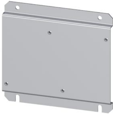
Base plate for mounting of combination of two contactors (2x 3RT1.5) for reversing