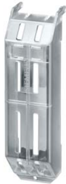
ISO cover IP2X for LV HRC base Sz. 00