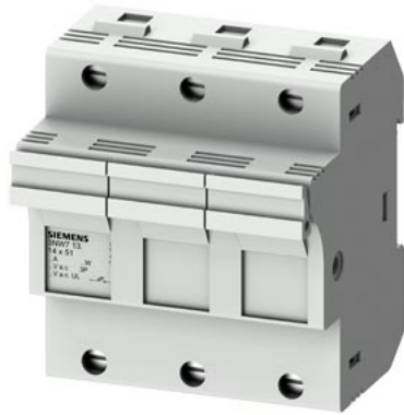
SENTRON, cylindrical fuse holder, 14x51 mm, 3-pole, In: 50 A, Un AC: 690 V, LED signal detector