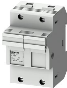
SENTRON, cylindrical fuse holder, 14x51 mm, 2-pole, In: 50 A, Un AC: 690 V