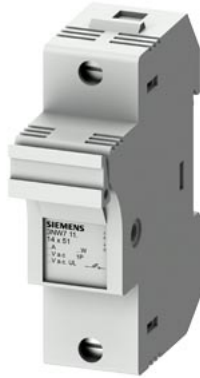
SENTRON, cylindrical fuse holder, 14x51 mm, 1-pole, In: 50 A, Un AC: 690 V, LED signal detector