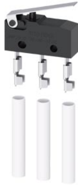
Auxiliary switch, 1 changeover contact, for Size NH000, accessory for fuse switch disconnecter 3NP1