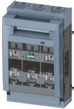
SENTRON, Fuse switch disconnecter 3NP1, 3-pole, NH1, 250 A, for Busbar system 8US 60 mm, Box terminal, Cover level 32/70 mm