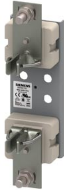
HRC fuse base ceramic Sz. 2 1-pole 400A 690V (1000V) flat terminal