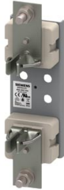
HRC fuse base ceramic Sz. 2 1-pole 400A 690V (1000V) double busbar terminal