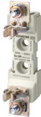
LV HRC fuse base Sz. 00, 1-pole 160 A 690 V (1000 V) Flat terminal, 95 mm 2