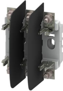
HRC fuse base plastic Sz. 00 3-pole 160A 690V flat terminal