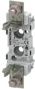
HRC fuse base plastic Sz. 00, 1-pole 160A 690V flat terminal