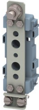
Neutral terminal base plastic Sz. 00 160A 690V