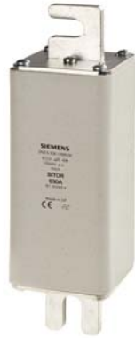
SITOR fuse link, with slotted blade contacts, NH2, In: 630 A, aR, Un AC: 1500 V, Un DC: 1000 V, without Indicator