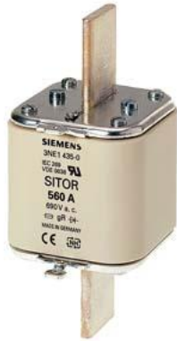
SITOR fuse link, with blade contacts, NH3, In: 560 A, gR, Un AC: 690 V, front indicator