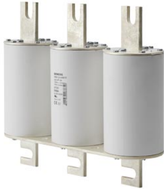
SITOR fuse link, with slotted blade contacts, 3 x NH3L, In: 2100 A, aR, Un DC: 1250 V, front indicator