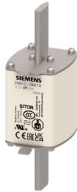
SITOR fuse size 2 450A aR 440V dc/500V VSI 500V dc UL @MBC 6xIn blade contacts