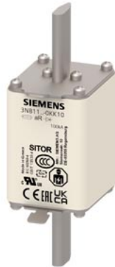
SITOR fuse size 1 160A aR 440V dc/600V VSI 500V dc UL @MBC 6xIn blade contacts