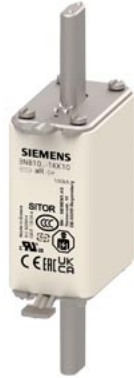
SITOR fuse size 0 80A aR 600V dc/900V VSI 750V dc UL @MBC 4xIn blade contacts